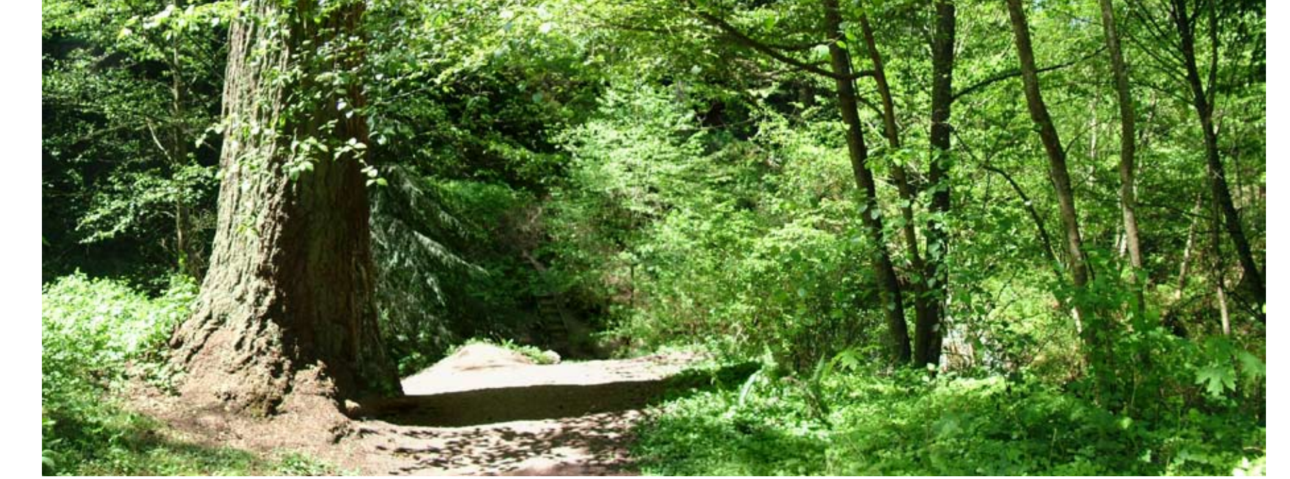
Recommended bridge approach location from north side, looking south