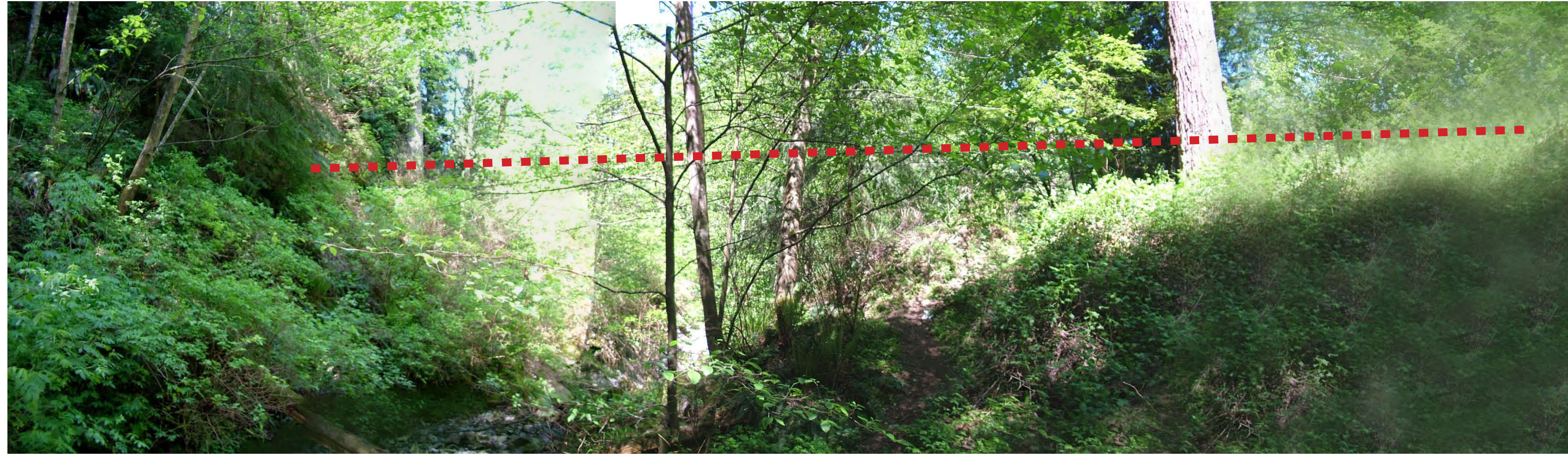
Looking west (downstream)