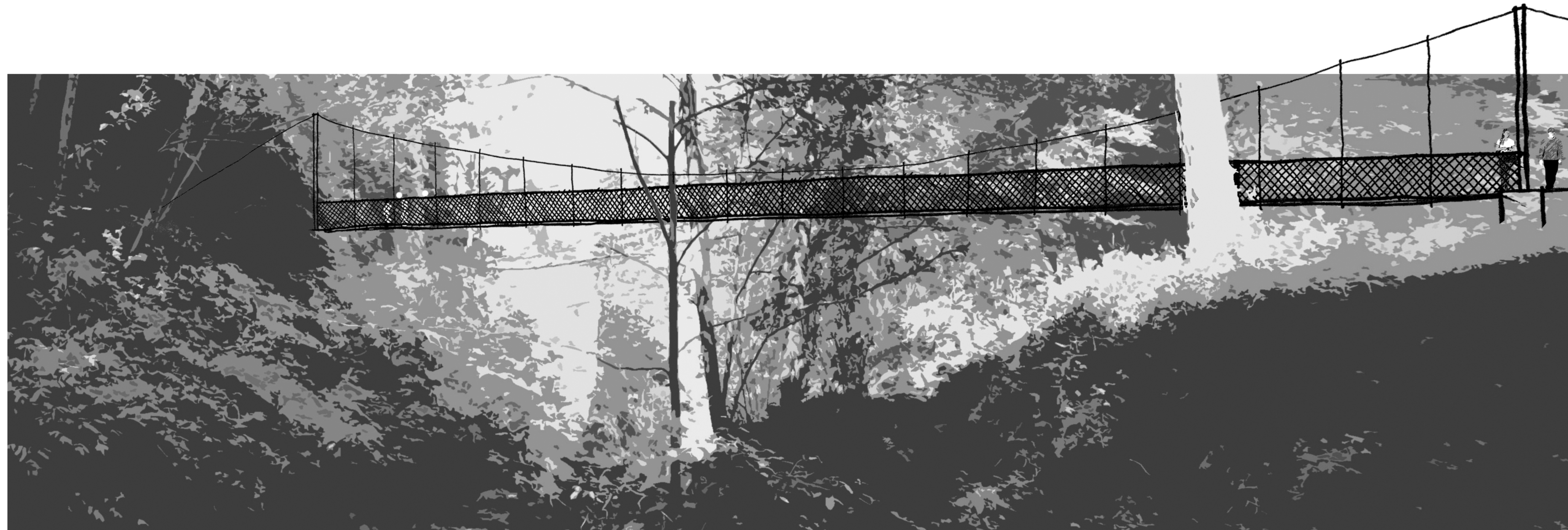
Looking west (downstream)