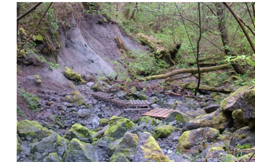
"Pallet crossing" with sandy slope beyond, looking west