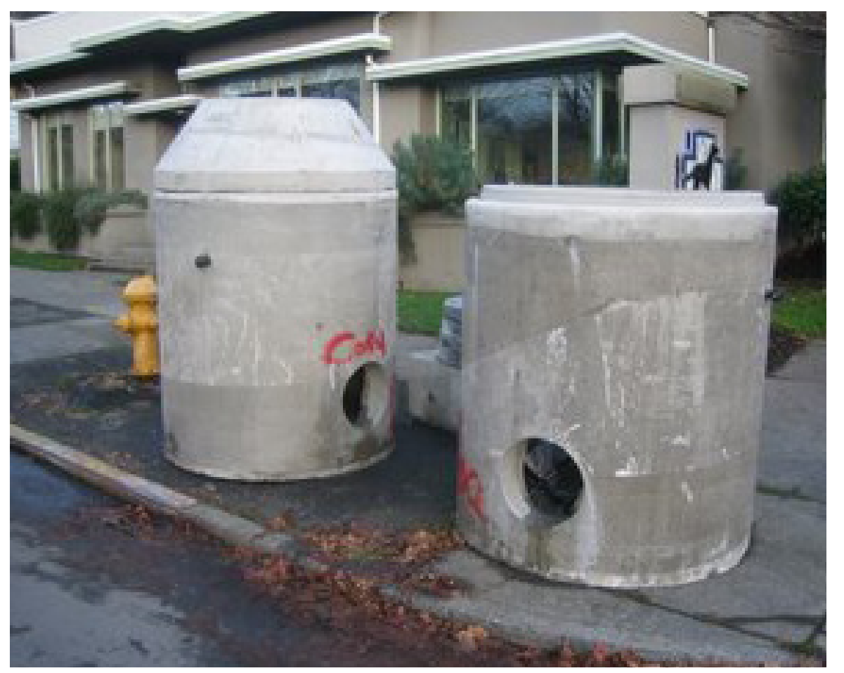
Storm Drain Maintenance Holes