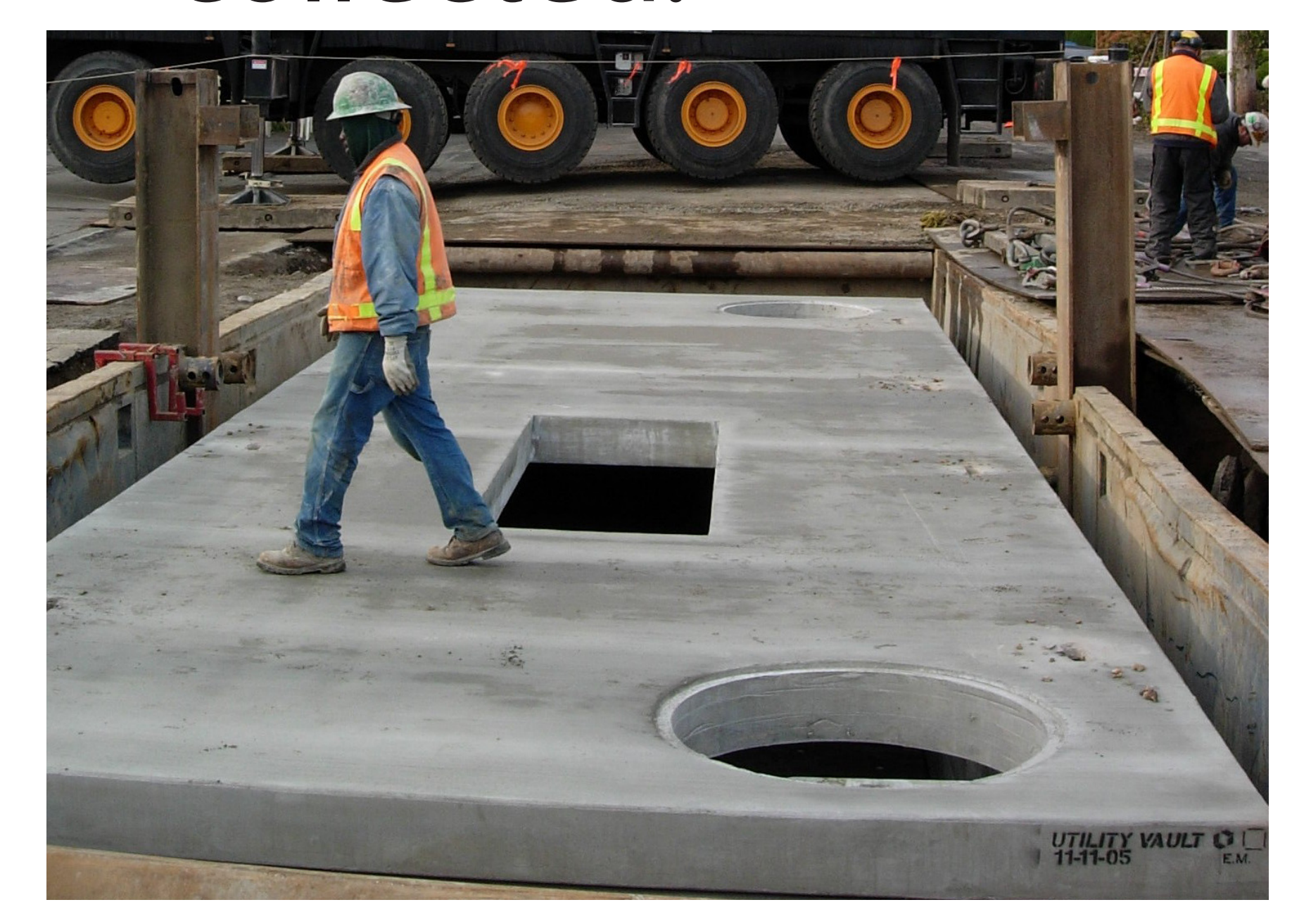
Stormwater Treatment Vault